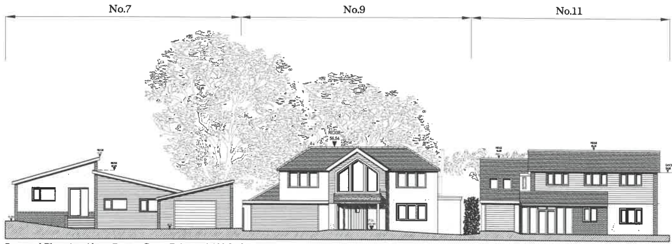
Proposed Elevation Along Bassett Green Drive @ 1:100 Scale