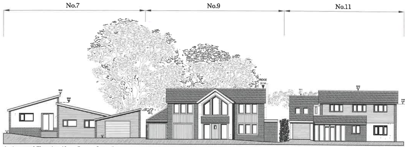
As Approved Elevation Along Bassett Green Drive @ 1:100 Scale